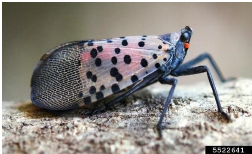
Figure 1: Adult spotted lanternflies are distinctive looking insects with a pink-khaki coloration and spots and stripes on their wings.

If you believe you have seen or captured a spotted lanternfly, please take a photo or capture the specimen and get it identified by the entomology department or submit it to a local extension professional.