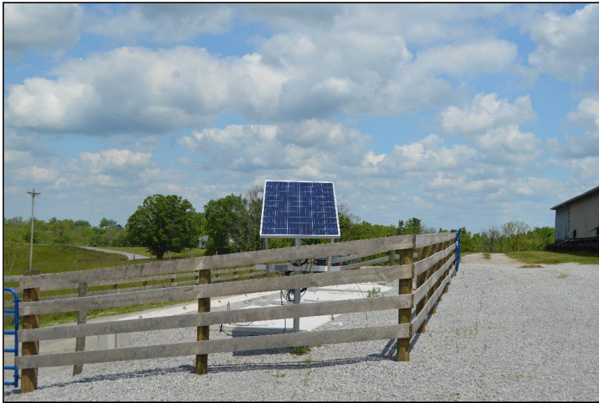
A solar powered pump installed in a water harvesting system.

Definition: The practice of using a solar panel and pump to distribute water within a water harvesting system. This practice includes the infrastructure necessary to direct, store, and distribute water. This practice is supported by NRCS practice standard codes 570: Stormwater Runoff Control, 614: Watering Facility, and 636: Water Harvesting Catchment. This practice is eligible for cost share through CAIP and EQIP in Kentucky.